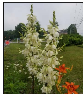
Adam's Needle ( Yucca filamentosa ) flower