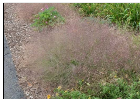
Purple lovegrass ( Eragrostis spectabilis )