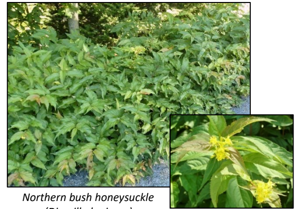
Northern bush honeysuckle ( Diervilla lonicera )