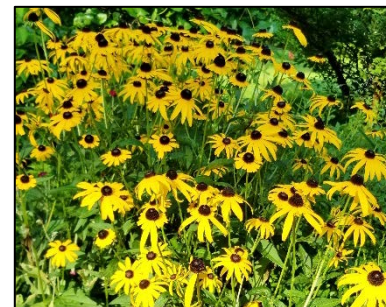
Black-eyed Susan ( Rudbeckia hirta )