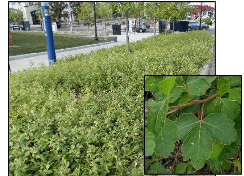
Fragrant sumac ( Rhus aromatica 'Gro-Low')